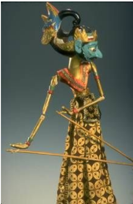
Batara Brama; Indonesia; Wayang Golek; c.1955. Wayang Golek is the only variety of round, wooden puppet found in Indonesia. Its use is confined to the western parts of Java. Gift of Nancy L. Staub. Permanent Collection.

Monday, May 4, 2009 ó Greene County Schools Monday, May 18, 2009 ó Putnam County Schools